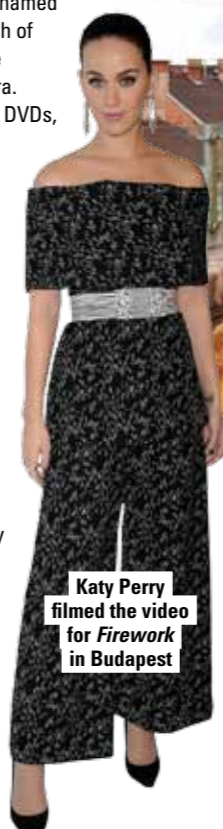
Katy Perry filmed the video for Firework in Budapest

great food and a hipster vibe. Be sure to cross the bridge over the River Danube and ride the funicular up to see the grand Parliament building and Hungarian castles. We had a fab night out at Szimpla Kert, one of