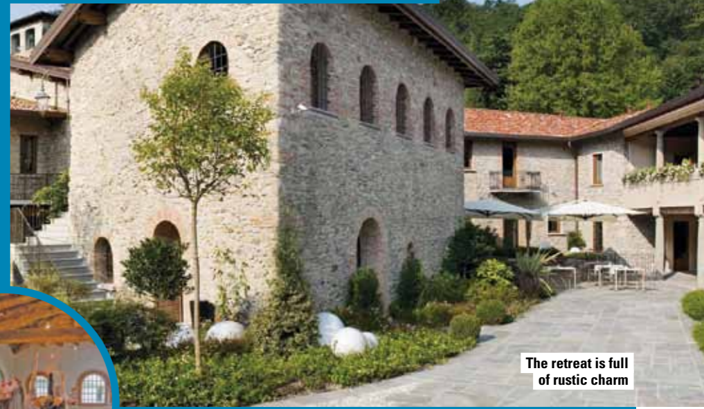
The retreat is full of rustic charm

OUT AND ABOUT The scenery around Ti Sana is simply stunning. Walk, or run, up the 349 steps of Santuario Madonna del Bosco (a chapel with serious wow factor) for breathtaking mountain views. Or head to the beautiful Lake Sartirana for a scenic walk. The retreat can also organise excursions to nearby Milan and Como.