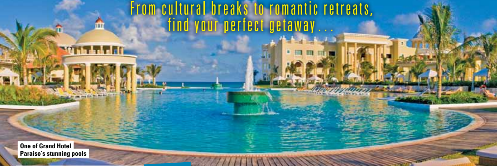
One of Grand Hotel Paraiso's stunning pools