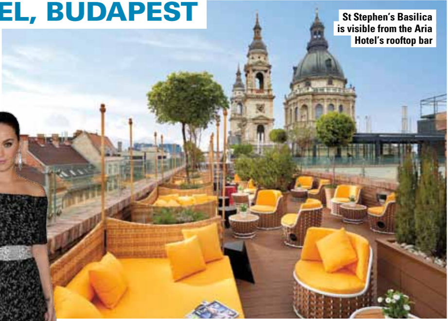
St Stephen's Basilica is visible from the Aria Hotel's rooftop bar

OUT AND ABOUT Start your sightseeing with a visit to the magnificent St Stephen's Basilica, which is opposite the hotel, then wander into the Jewish Quarter for