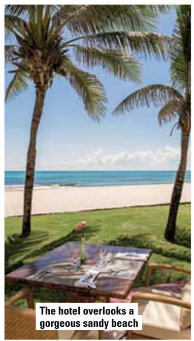
The hotel overlooks a gorgeous sandy beach