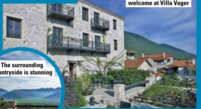
The surrounding countryside is stunning

petrifying but beautiful journey to Olympia to see the ancient stadium. Closer to home, there are monasteries and the idyllic mountain towns of Dimitsana and Stemnitsa to visit, or you can just wander through the lush valleys. The hotel can provide pizzas in the evening on request, or you can try a delicious gyros pitta in the local restaurants in the town square.