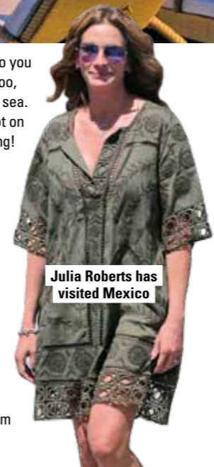
Julia Roberts has visited Mexico

NEED TO KNOW Signature from Thomas Cook offers seven nights at Iberostar Grand Hotel Paraiso on an all-inclusive basis from £1,605 per person based on two sharing, including flights. See thomascook.com or call 0844 412 5970 to book.