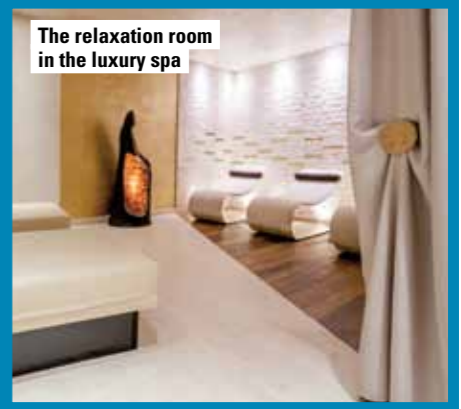
The relaxation room in the luxury spa

45-minute drive to Ti Sana. Book your wellness break at 1711.it from £2,000 per person for four days including diagnosis tests, five spa treatments, a customised nutrition plan (full board) and takeaway food kit, fresh juices and teas, one excursion, a cooking class, airport transfers, two daily activity classes and use of all the facilities. You can choose between slimming, relaxing and energising packages.